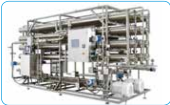
INDION® Integrated Dye Desalting, Water Recovery & ZLD System