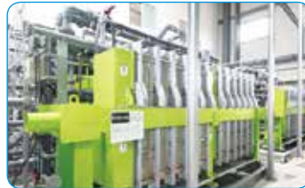
Electrodesalination Reversal (EDR)

* In collaboration with ASTOM ASTOM Corporation