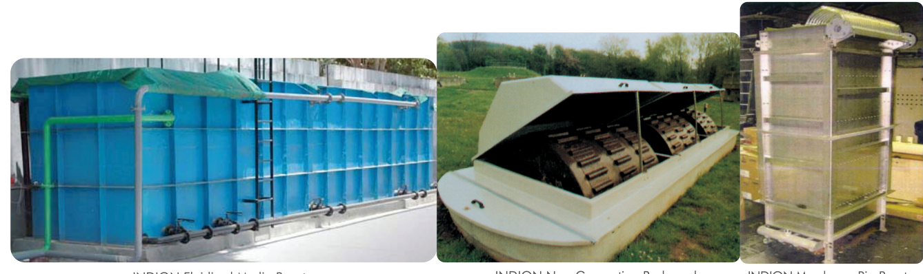
INDION Fluidised Media Reactor

We also offer packaged sewage treatment plant based on advanced proprietary fluidised media reactor (FMR), MBBR and membrane bio-reactor (MBR) process for higher capacities - flow rates.