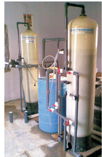
INDION Fluoride Removal System

because of canal water sources our state-of-art continuous sand filters provide an effective solution for removal of these impurities. These filters by virtue of their unique design are ideally suited for rural areas because they require no operator attention/stoppage for backwash and can also withstand spikes and higher levels of turbidity and suspended solids.