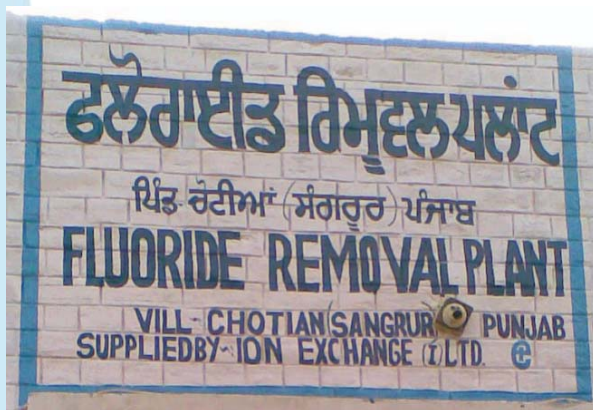
Our 2000 l/h fluoride removal system was installed at Chotian (Sangrur) village, Punjab

Since the raw water source in various areas in the state had different contaminants, the choice of technology was a crucial deciding factor in the government choosing to partner with Ion Exchange for these solutions. Our state-of-art fluoride removal systems are used to treat water