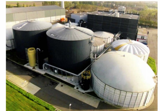
Sludge Digestion - Waste-to-Energy