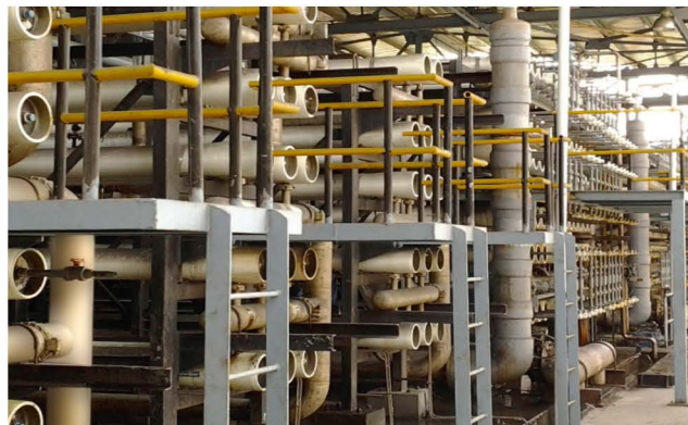
Sea Water Reverse Osmosis (Desalination) at Thermal Power Station