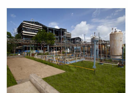
Resins Manufacturing Unit at Ankleshwar, Gujarat