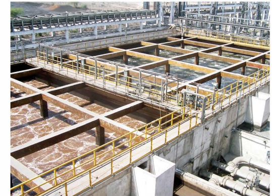
Effluent Treatment Plant at Refinery

Solutions integrate physicochemical, biological and membrane separation processes for optimum water recovery. These include micro filtration, ultra filtration, nano filtration and reverse osmosis systems, membrane bioreactors and advanced photochemical oxidation.