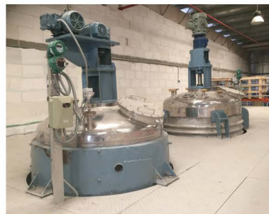
Chemical Blending Plant at Bahrain