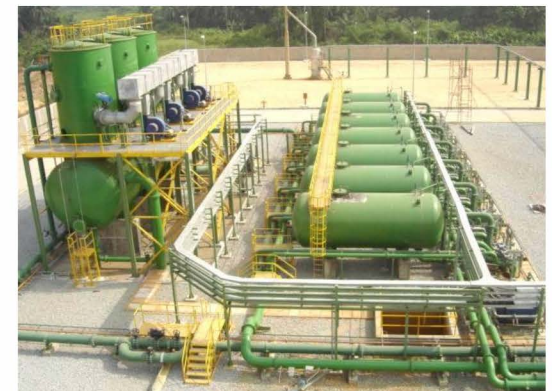
Filtration System at Power Plant