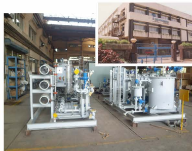
Export Oriented Unit at Rabale, Maharashtra