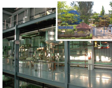
Industrial Chemical Division at Patancheru, Telangana