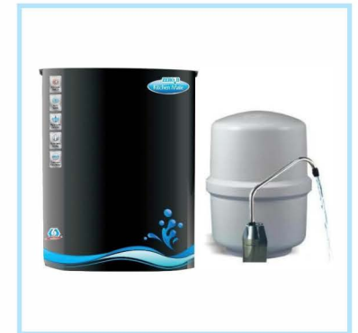
Zero B Kitchen Mate