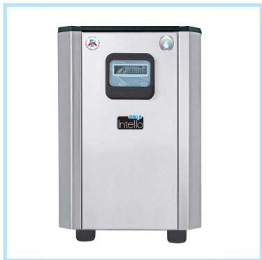
Zero B Intello