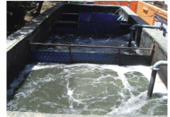
Fluidised Media Reactor for Sewage Treatment & Water Recycle