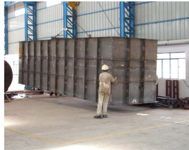
Fabrication & Assembly Facility at Hosur, Tamil Nadu