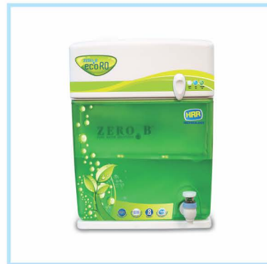
Zero B eco RO