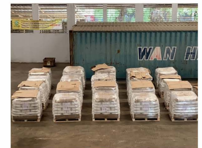
Warehouse & Assembly Centre at Indonesia