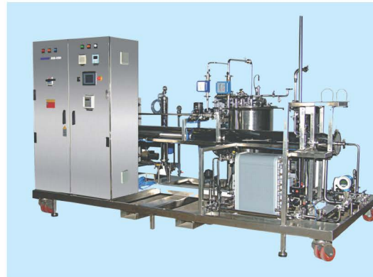
Reverse Osmosis (RO) Electrodeionisation (EDI) for Pharmaceutical and Electronics Industries