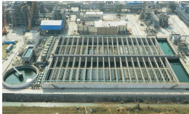
Effluent Treatment Plant for Steel Industry