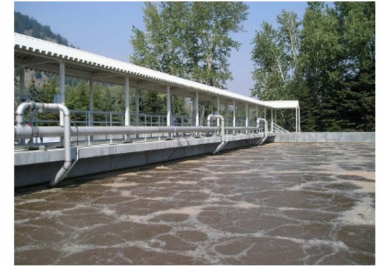
Drinking Water Treatment for Municipality

Our wide range of solutions for surface and ground water treatment remove pollutants ranging from simple silt to contaminants such as arsenic, fluoride, iron, nitrate, organics and salinity. We undertake turnkey projects on EPC or BOO/T basis for water supply and distribution, drinking water treatment, sewage treatment and disposal, sea water intake and desalination, solid waste management and waste-to-energy projects - all backed by operation and maintenance services for continuous, optimum performance.