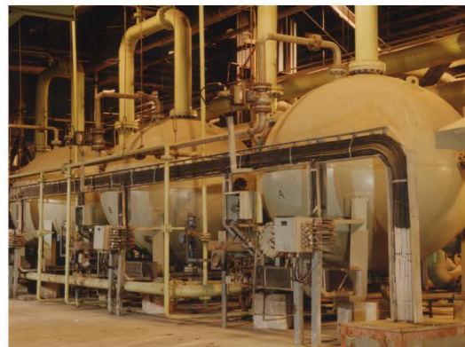
Condensate Polishing Units for Power Plant