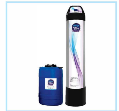
Zero B Softener