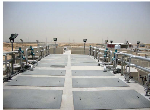
Membrane Bioreactor Plant at Industrial Area