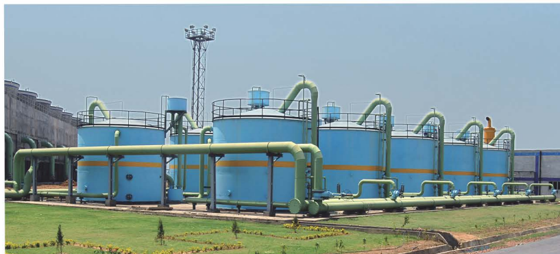
Side Stream Filters at Steel Facility