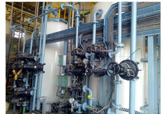
Glycol Purification for Chemical Plant