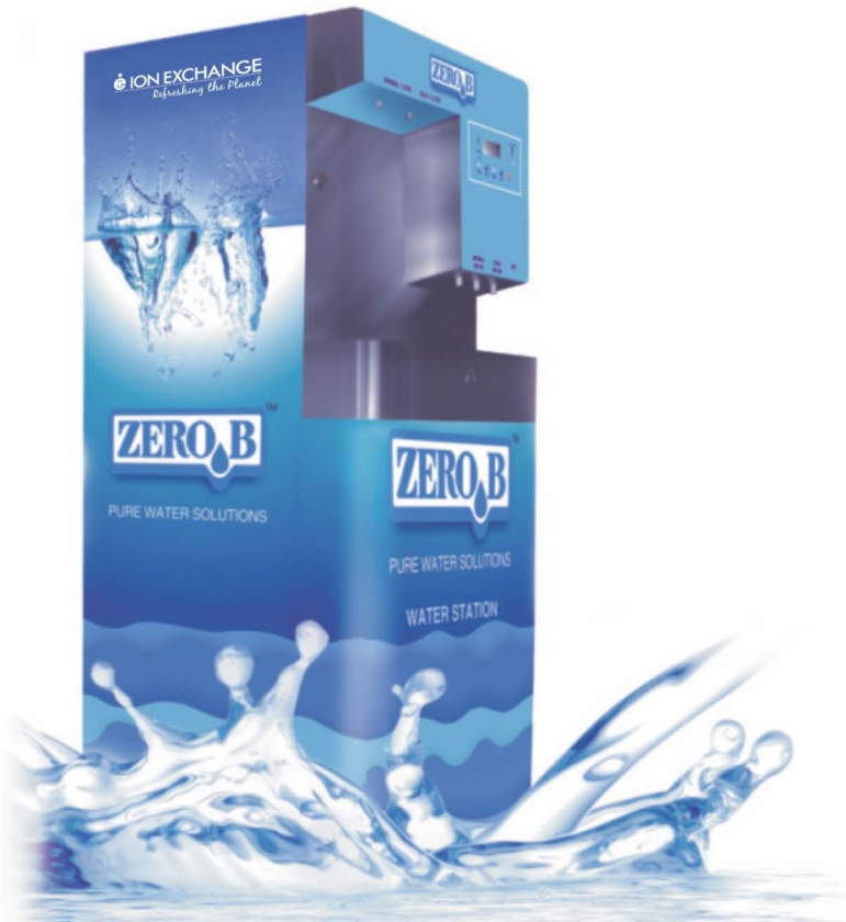
Water Vending Machine