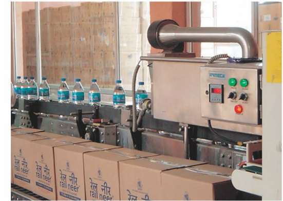
Packaged Drinking Water Plant for Railways

We offer systems for drinking water purification, swimming pool filtration, disinfection, water conditioning for utilities, treatment of sewage and recycle.