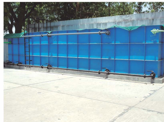
Fluidised Media Reactor at a Hotel