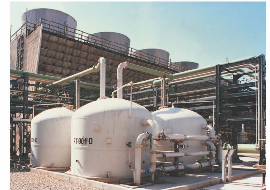
Cooling Water Treatment