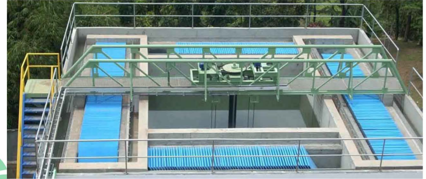
Ultra High Rate Clarifier for Textile Plant

Our comprehensive solutions extend from influent water through potable & process water, effluent treatment, water reuse & zero discharge and waste-to-energy projects. We take great pride in providing 24x7 support service that ensures high performance continuity.