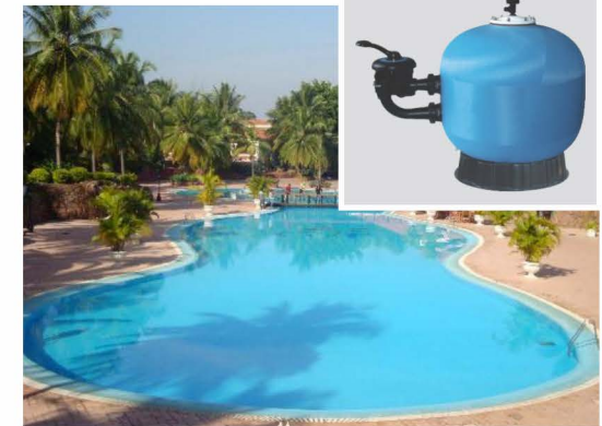
Swimming Pool Filters