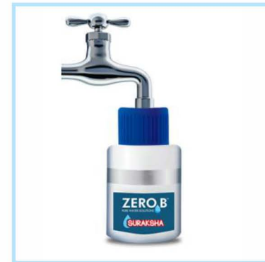
Zero B Suraksha Tap Attachment