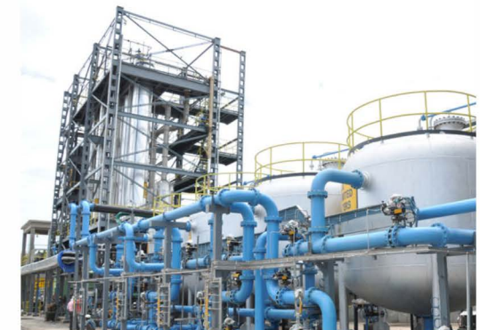
Zero Liquid Discharge System at Synthetic Rubber Plant