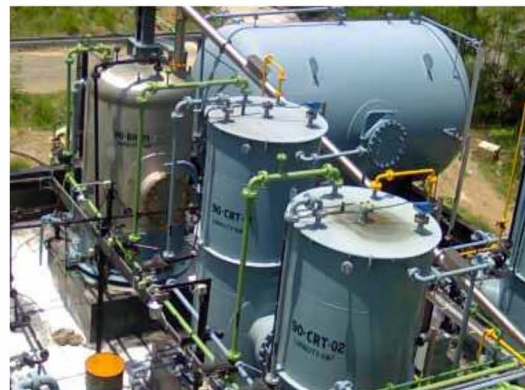
Boron Enrichment Plant for Heavy Water Board