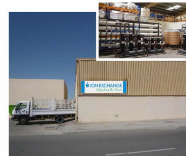
Assembly Unit at Sharjah, UAE