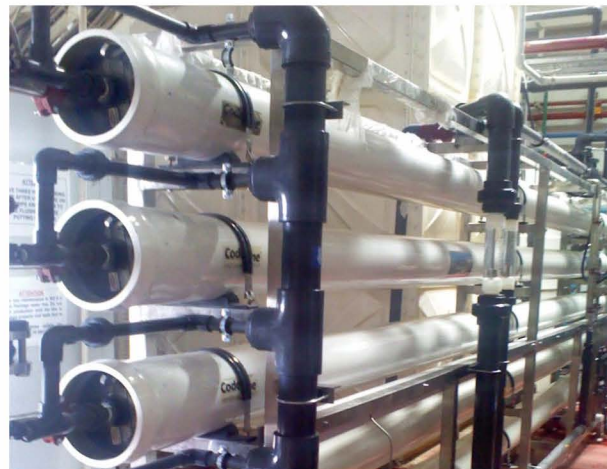
Reverse Osmosis Plant at Food & Beverage Industry