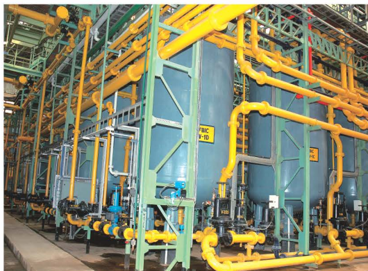
Uranium Recovery Plant at Mining Industry