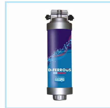
Zero B Iron Remover