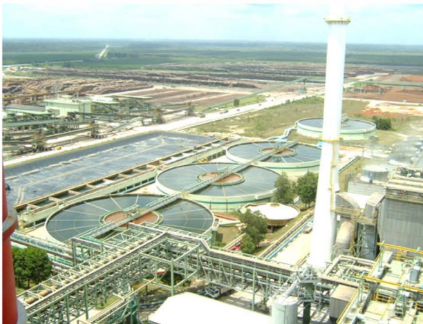
High Rate Solids Contact Clarifiers for Paper Industry

If we want a sustainable future for coming generations, there is a need to protect the environment and conserve natural resources. We help industries to use their water and energy resources more efficiently and provide solutions that address the needs of each customer. Through quantifiable benefits we have demonstrated time and again that efficient water and environment management is a value investment.