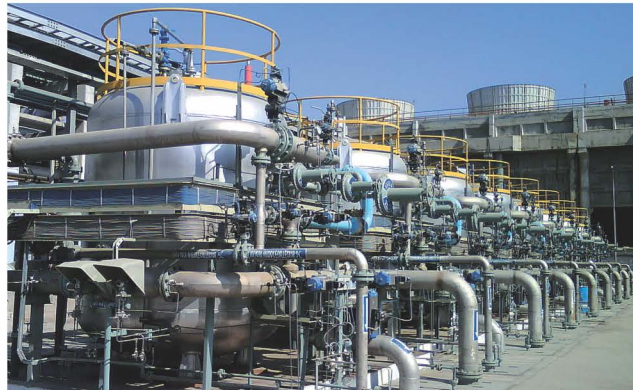
Deminalisation Plant at Petroleum Industry