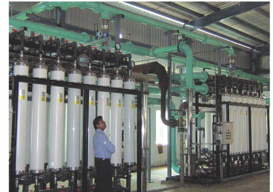
Ultra Filtration at Paper Industry