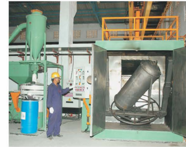
Fabrication Plant at Wada, Maharashtra