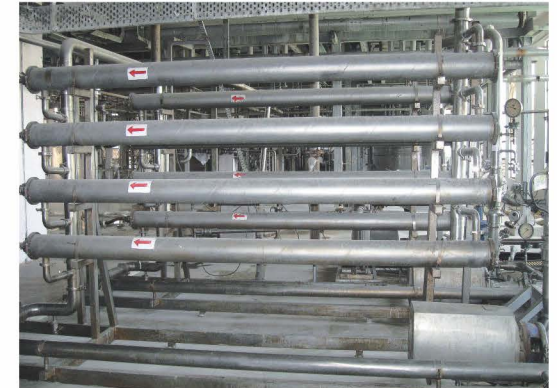
Gelatine Concentration Ultra Purification Unit in Food and Beverage Industry

Speciality process chemicals for the sugar, paper, ceramics, oil refining, mining, steel and textile industries help to increase efficiencies and product quality.