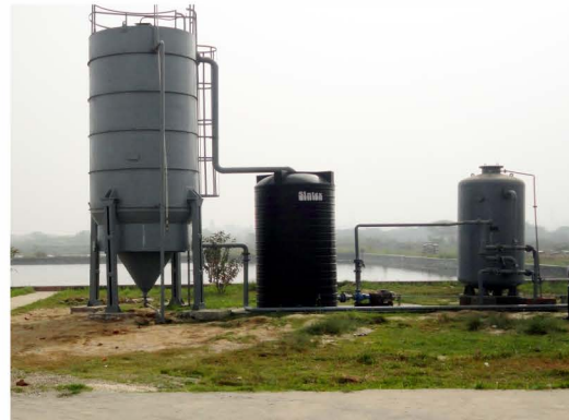
Continuous Sand Filter for Surface Water Treatment