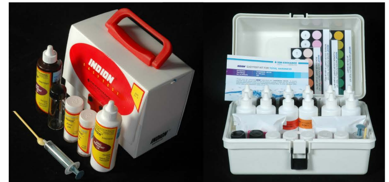
Water Test Kits and Refills