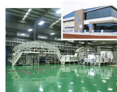
Membrane Manufacturing Unit at Verna, Goa