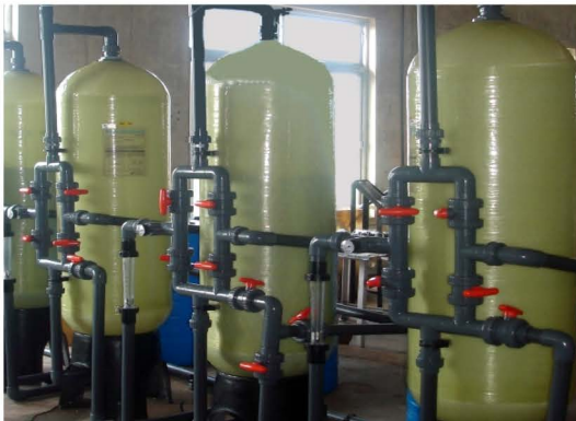
Arsenic Removal Plant for Ground Water Treatment