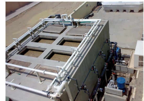
Membrane Bioreactor at Commercial Complex