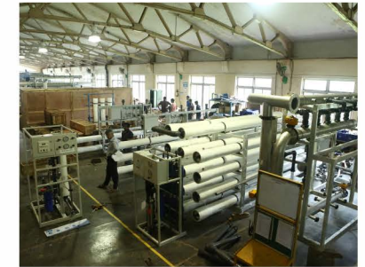
Fabrication & Assembly Facility at Verna, Goa