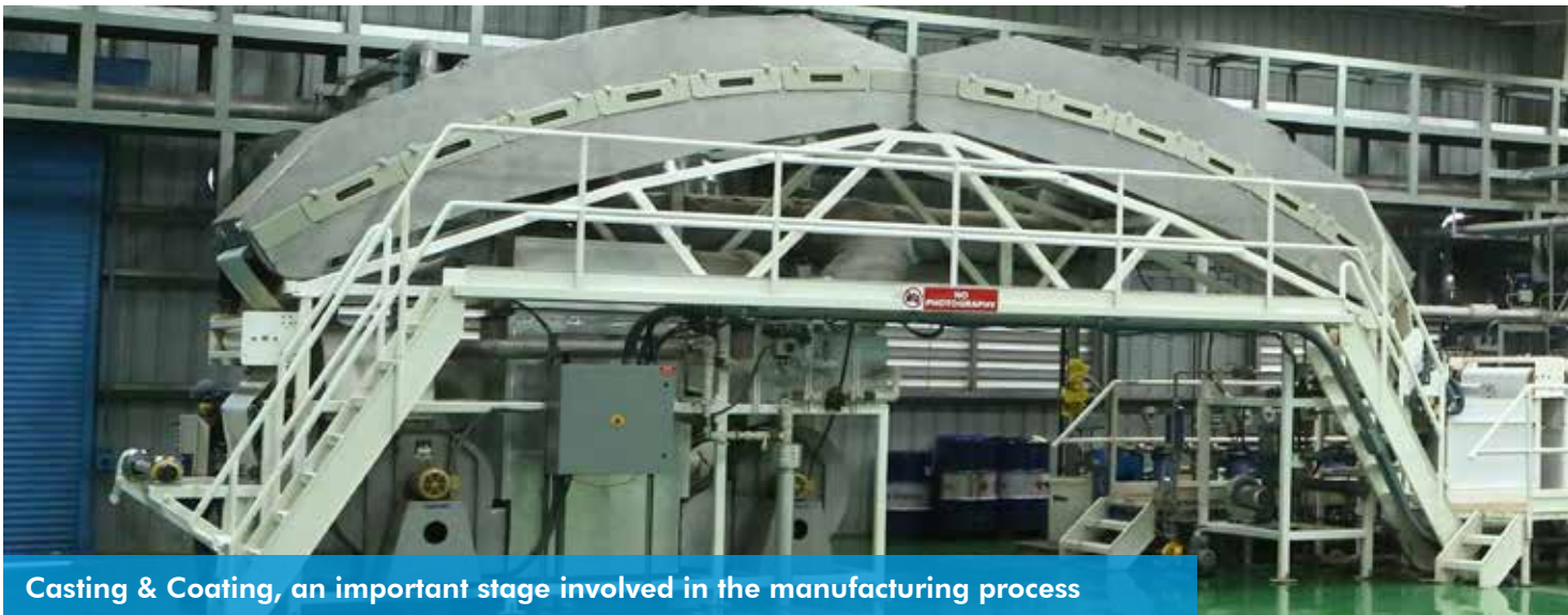
Casting & Coating, an important stage involved in the manufacturing process