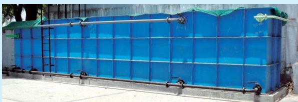
Fluidised media reactor (FMR)

If the quantity of sewage to be treated is quite high, fluidised media reactor technology may be the best.