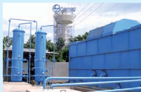
New generation packaged sewage treatment plant (NGPSTP)

in small housing complexes, compact sewage treatment plants are more suited.