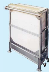
Membrane bio-reactor module

Here, while the capital cost is lower, the quality of treated sewage is not as good as that obtained with the MBR system. The recycled water is suitable for low end purposes such as flushing, gardening and in some cases, even as cooling tower makeup, after appropriate tertiary treatment. For treatment of smaller quantities of sewage such as