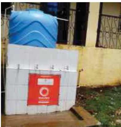
Construction/Renovation of Toilets & Water Storage Tanks, Maharashtra, through NGO - Swades