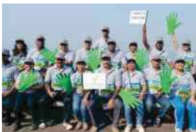
Running for a Cause at the Standard Chartered Mumbai Marathon