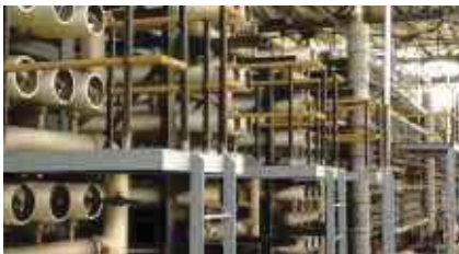
Sea water reverse osmosis (desalination) plant at a thermal power project