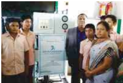
Water Purification Plant at Government Secondary School, Tamil Nadu