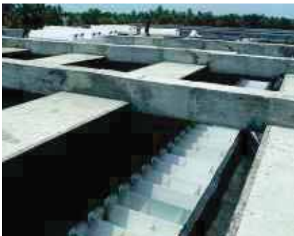
Waste treatment and energy recuperation for a paper plant