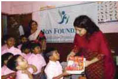
The Kids Remedial Education, Kolkata