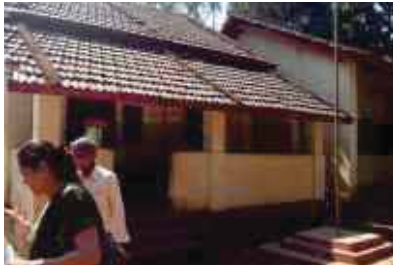
Government Primary School, Goa