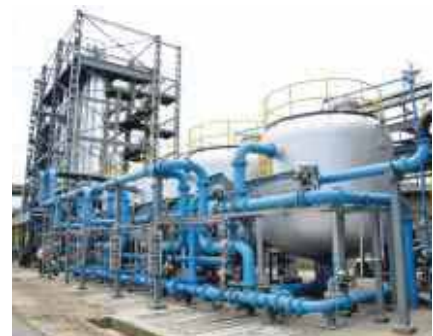
Zero liquid discharge plant at a downstream petrochemical project