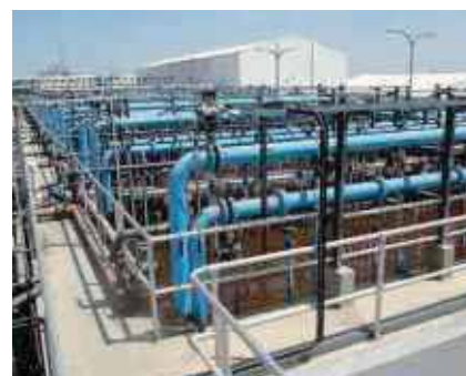
Zero liquid discharge plant for a textile project