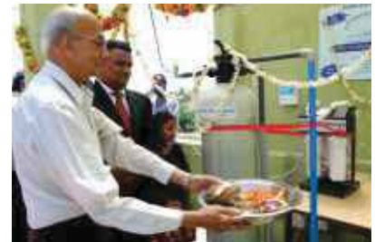
Water Purification Plant at SoCare Ind, Karnataka