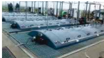
Tertiary sewage treatment for use as water source for a power project