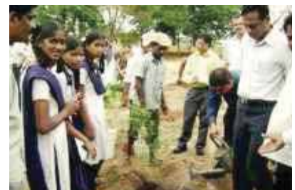
Tree Plantation at Government Zilla Parishad School, Telangana