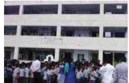
Sanrangpur Prathmik Primary School, Gujarat