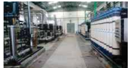
Effluent recycle system for a fertilizer project