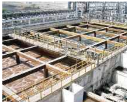
Zero liquid discharge plant at a refinery complex