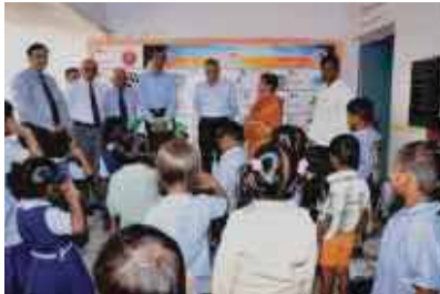
Chitkul Primary School, Andhra Pradesh