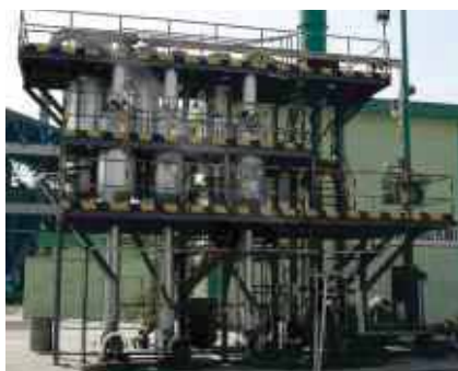
Zero liquid discharge plant at a cement project